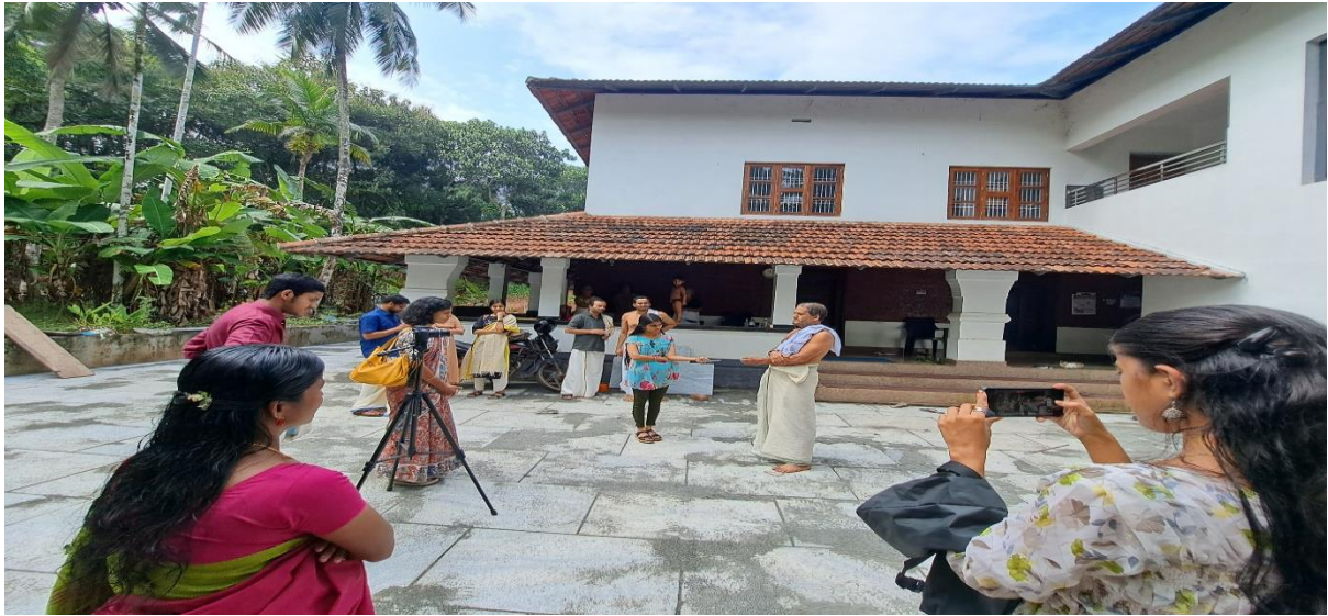
Students Collecting data for Survey - Abbli Vadhyan Illom