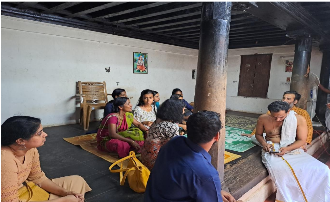
Students Collecting data for Survey - Perkkundi Illom