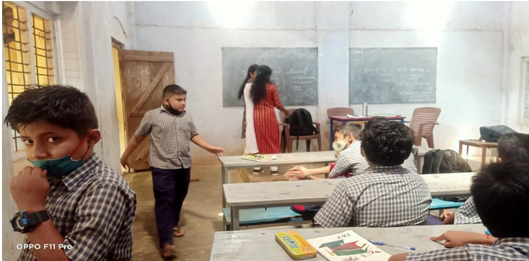
Students Collecting data for Experimental Study - Control Group (students of Parli Higher Secondary School, Phase II)