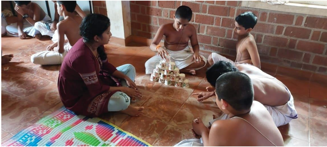
Students Collecting data for Experimental Study- Experimental Group (students of Kanchi Kamakodi Yajurveda Padhasala)