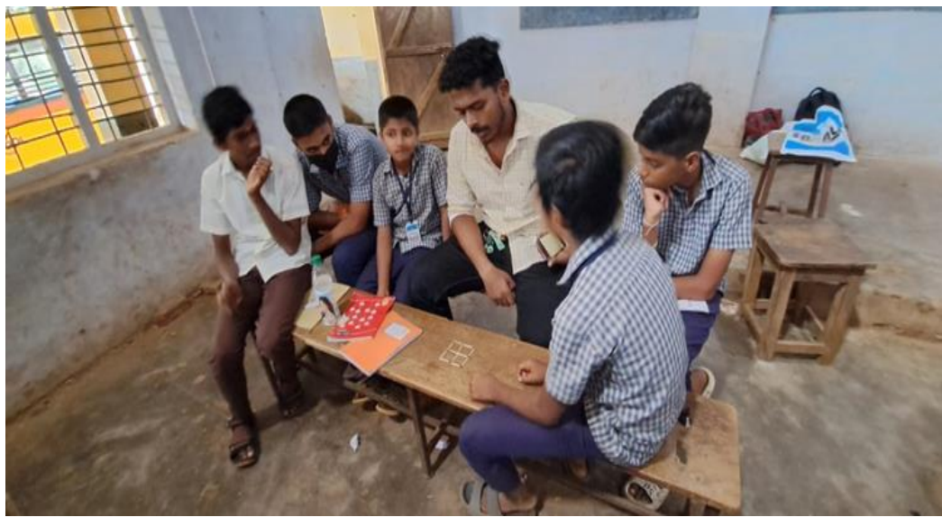
Students Collecting data for Experimental Study- Control Group (students of Parli Higher Secondary School)