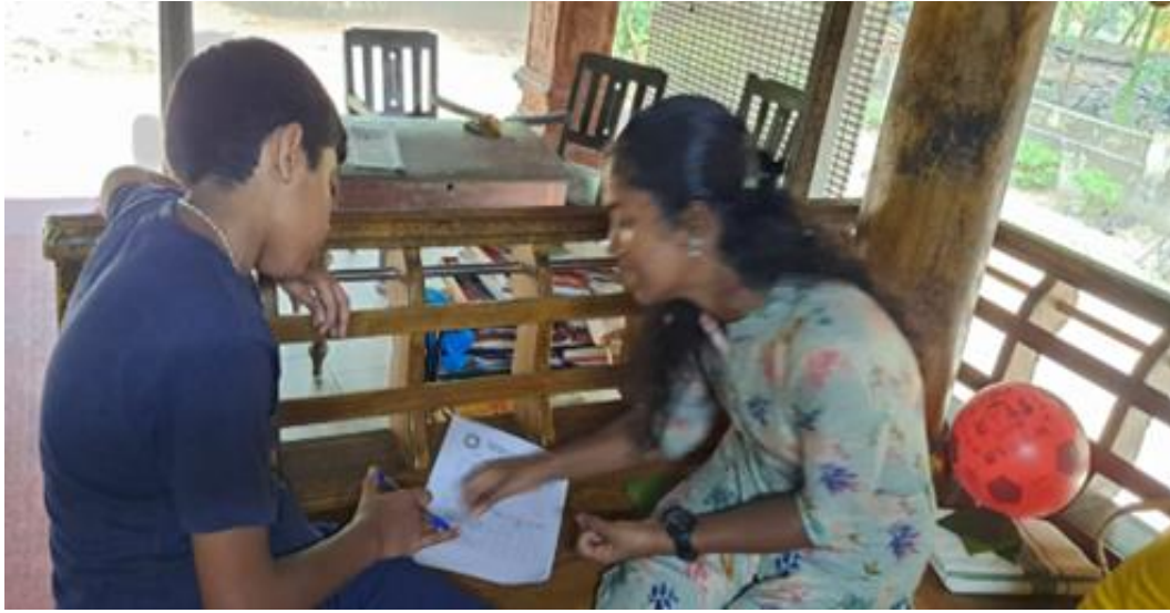
Students Collecting data for Experimental Study- Experimental Group (students of Mullamangalam Veda Padhasala)