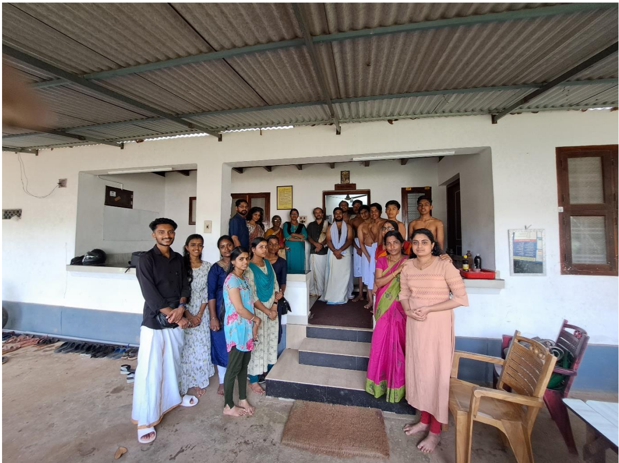
Students Collecting data for Survey - Raghavapuram Veda Pathasala