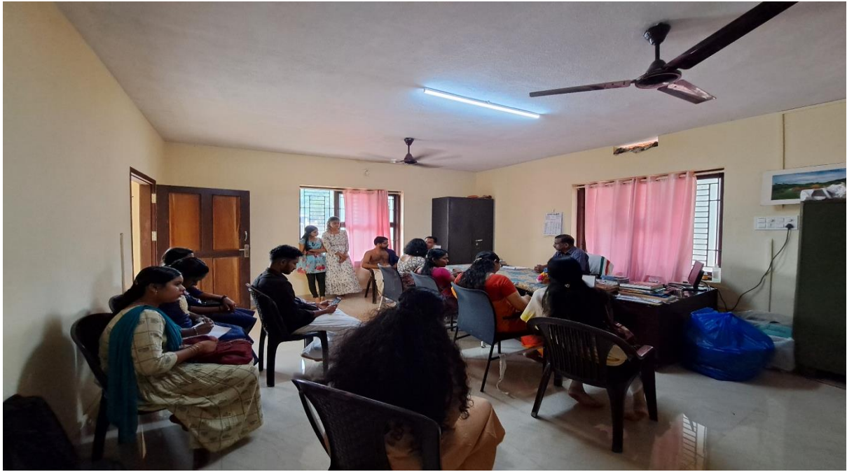
Students Collecting data for Survey - Raghavapuram Veda Pathasala