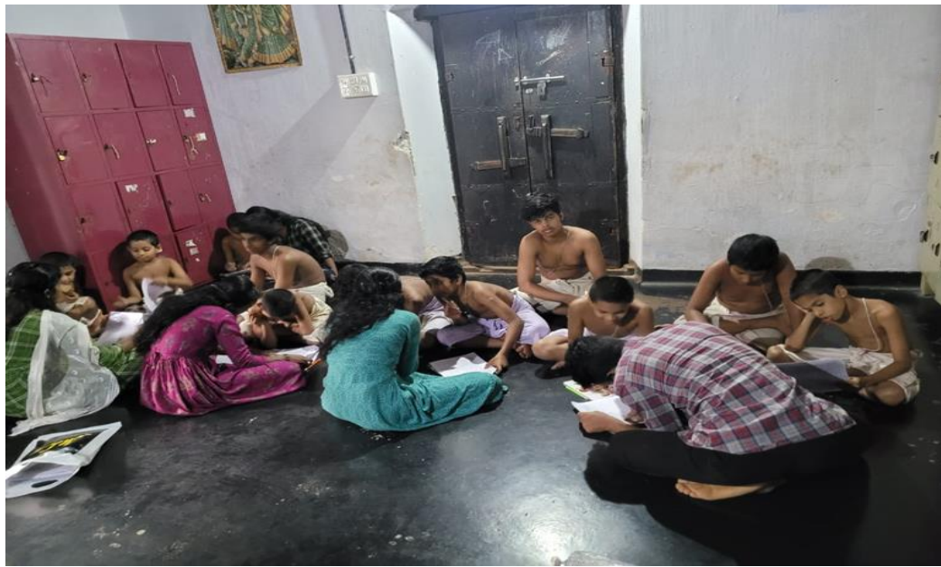
Students Collecting data for Experimental Study- Experimental Group (students of Vadakkemadhom Brahmaswam Veda Padhasala)