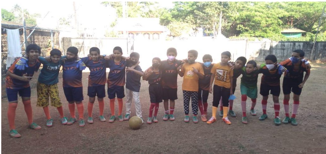
Students Collecting data for Experimental Study- Experimental Group (students of Kanchi Kamakodi Yajurveda Padhasala)