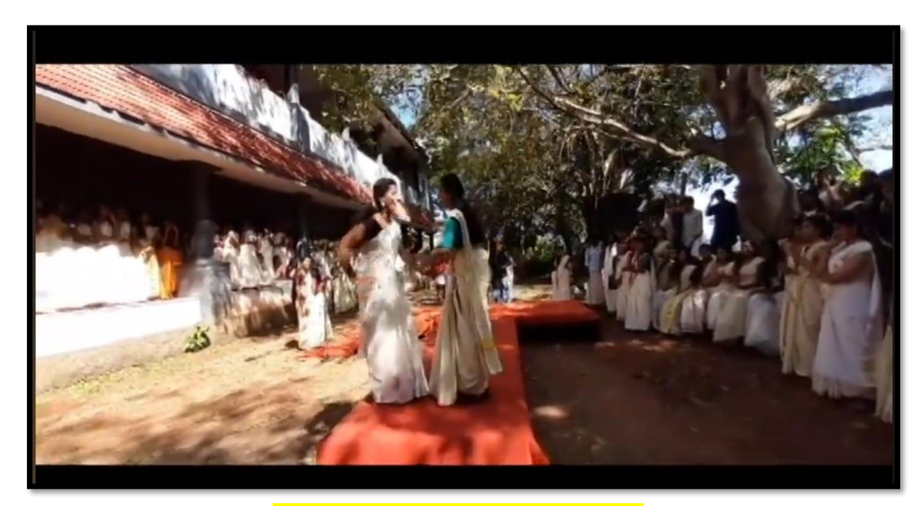
Malayali Mannan and Manga Contest