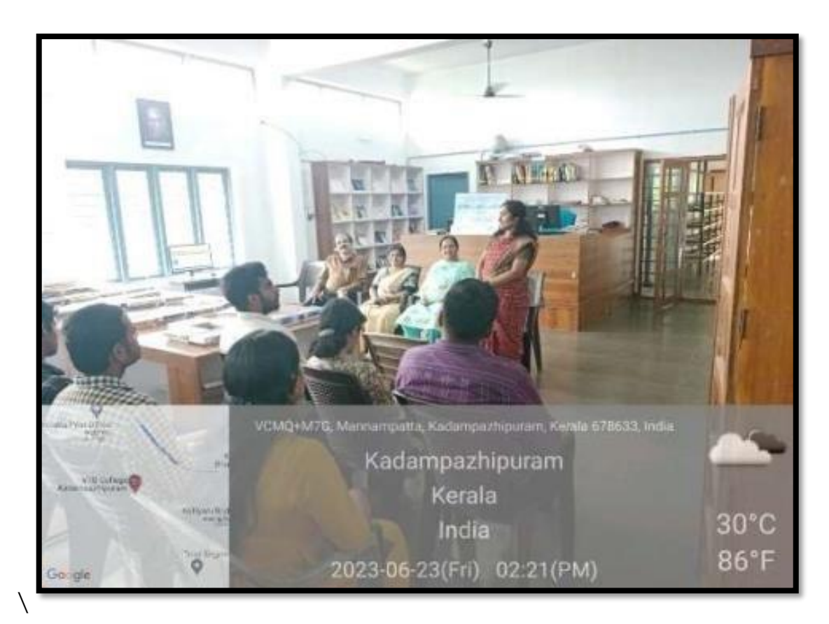
Reading Day Inauguration

By celebrating National Reading Day, the college promoted linguistic inclusiveness by exposing students to diverse languages and literature, encouraging language appreciation and understanding, and providing a platform for students to share their favorite books and authors.