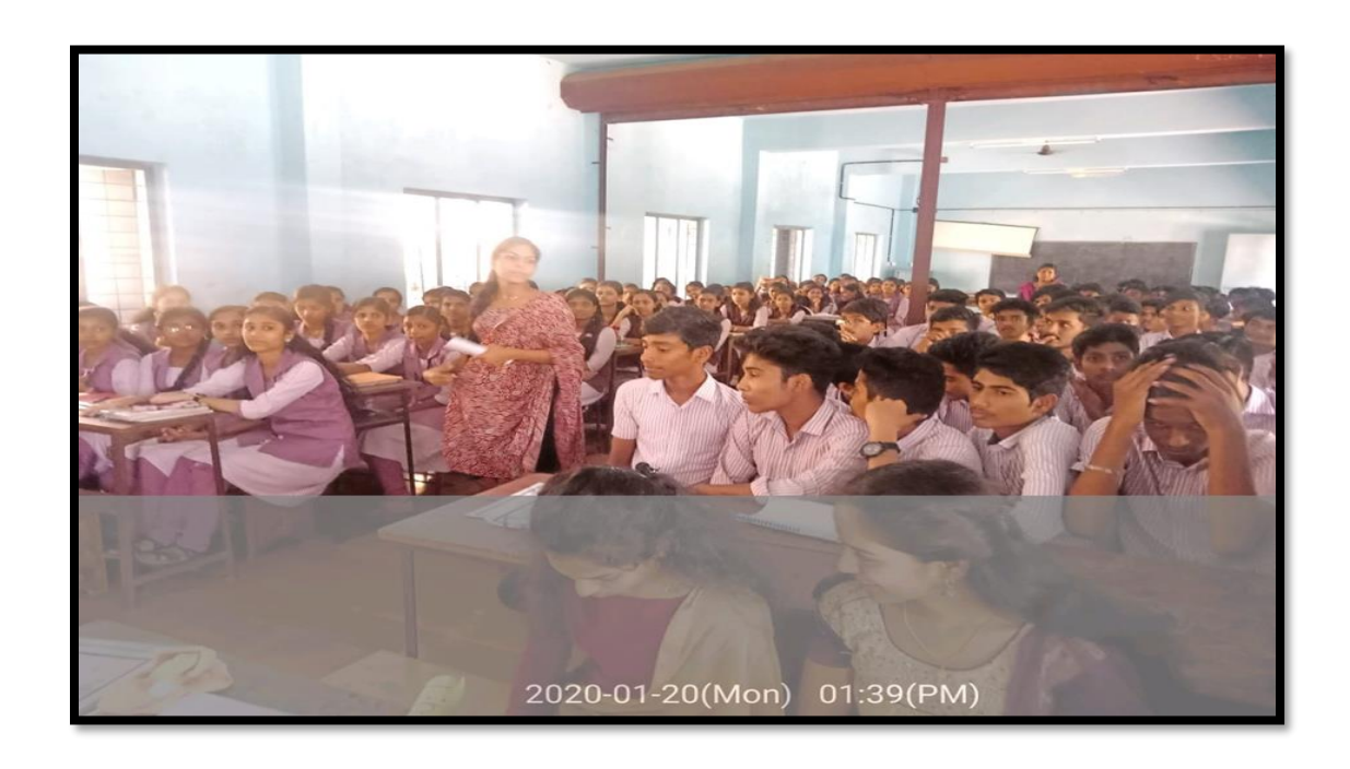
Students Taking Class in Various Schools