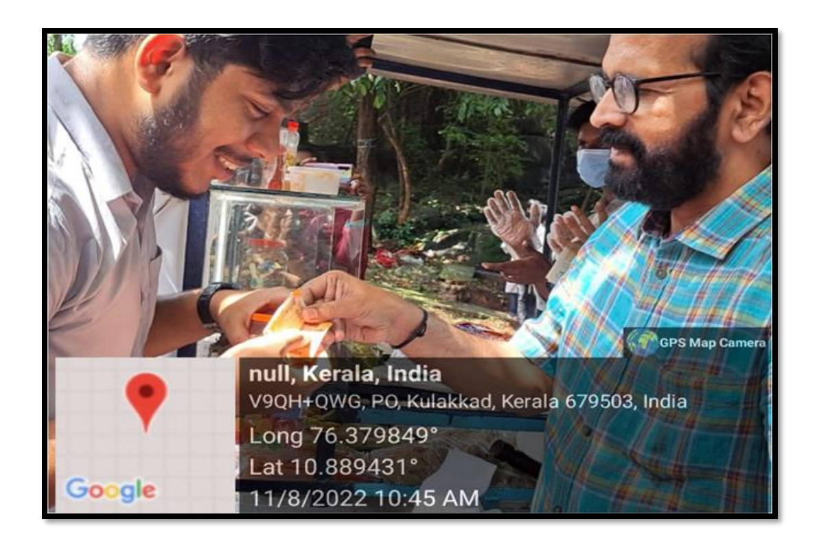
Inauguration by the Principal