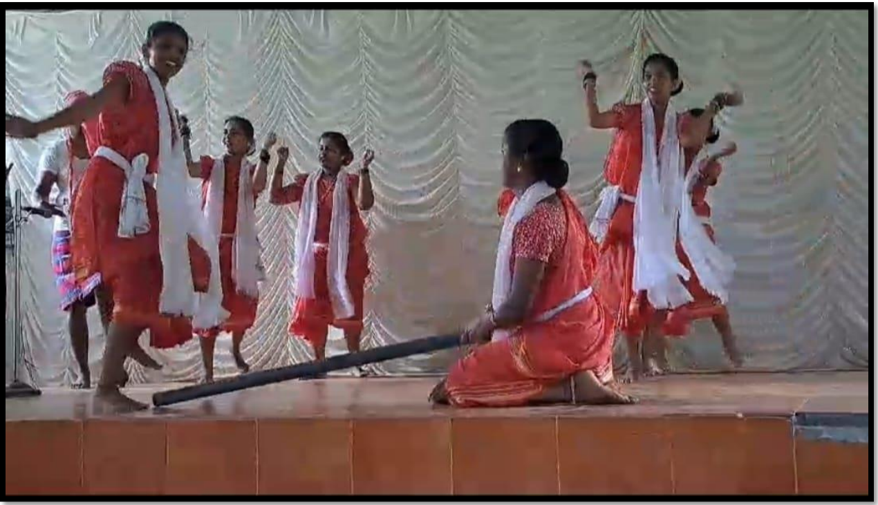
Goan's Artists performing their Traditional Dance form