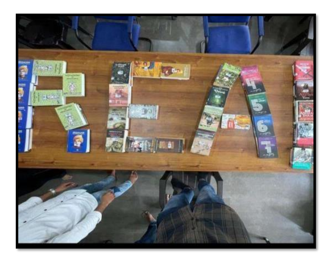
Students showing READ using Books