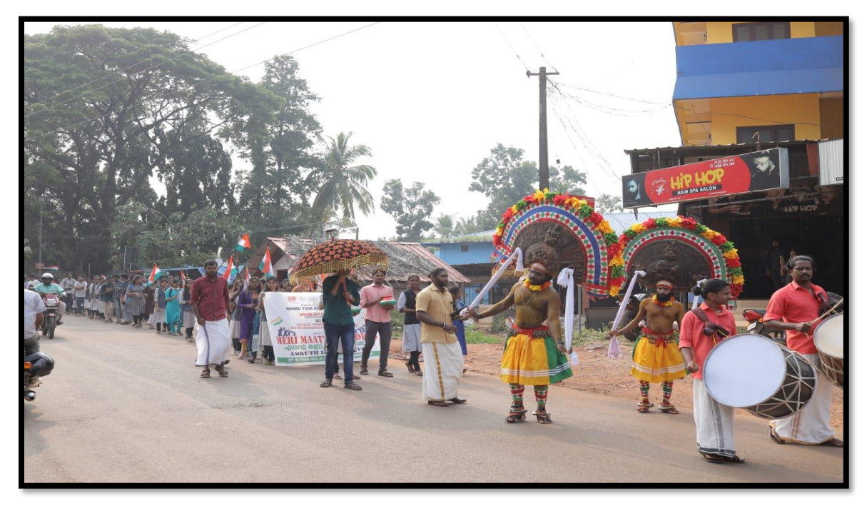
Meri Maati Meri Desh rally photos