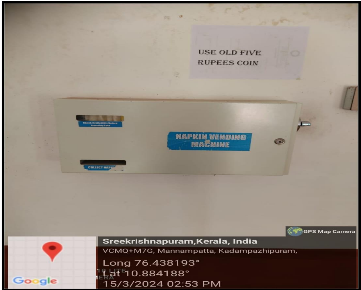
Sanitary vending machine installed in Ladies Room

College has taken a significant step towards promoting menstrual hygiene and women's empowerment by installing a Sanitary Pad Vending Machine on campus. By installing this vending machine, the college has created a safe, accessible, and stigma-free environment for girls and women to manage their menstrual health, promoting a culture of inclusivity and support.