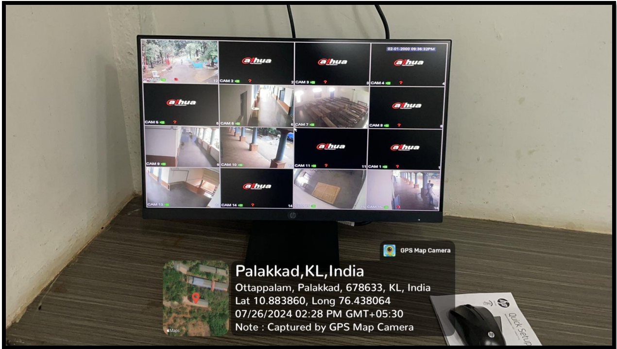
Monitoring unit at Principal's office